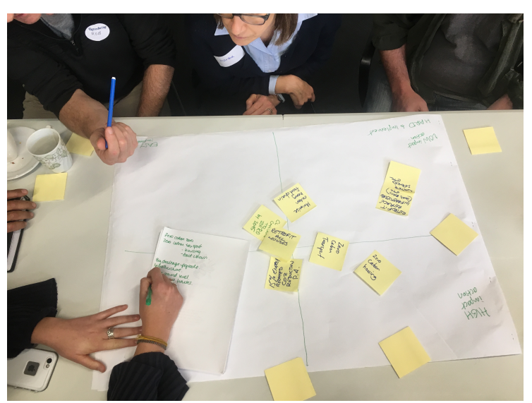
BRCT's "Our City, Our Climate" workshop, March 2018.

Major new expenditure on new and major projects is being proposed. We have few comments to make in relation to this proposed expenditure but request that Council employs the Dynamic Adaptive Pathway Planning approach to planning. This approach, proposed by the MfE "identifies ways forward ( pathways ) despite uncertainty, while remaining responsive to change should this be needed ( dynamic ). [...] Pathways are mapped that will best manage, reduce or avoid risk. A plan is developed, with short-term options, and includes pre-defined points (triggers) where decisions can be revisited. This flexibility allows the agreed course of action to change if the need arises such as, if new climate change information becomes available. By accommodating future change at the outset, this approach helps avoid locking in investments that could make future adjustments difficult and costly".