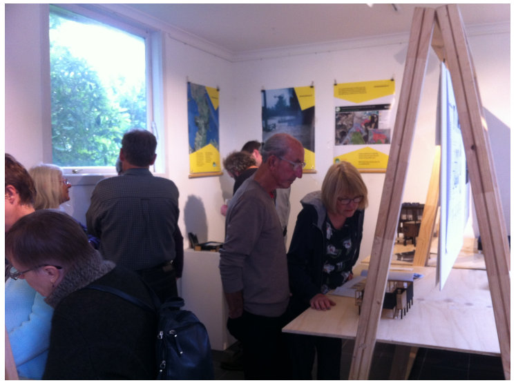
2017 exhibition of climate safe house designs.

Our particular concern is with the areas in our settlements most at risk and the vulnerable households who are increasingly financially and emotionally affected as each adverse event places them in a more precarious situation.