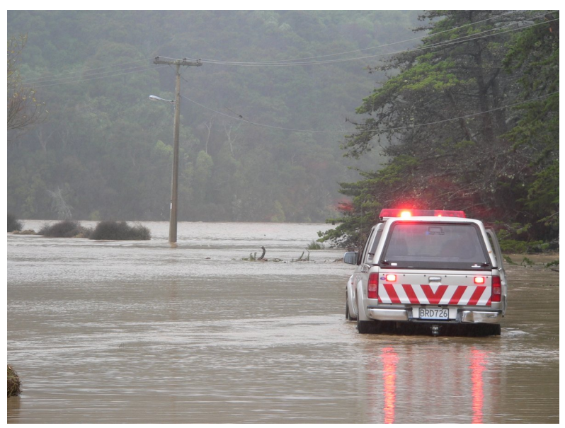
Doctors Point Road near Blacks Bridge under.

Climate impacts are not limited to flooding property: extreme weather events have a number of different and cascading impacts. Our transport network connects our settlements to each other and keeps us 'connected' people in vibrant and cohesive communities. Yet storm events can lead to slips, particularly on Coast Road between Evansdale and Karitane, and Blueskin Road connecting Waitati to Purakaunui, Osborne and Long Beach. Flooding too damaged SH1 in 2017 and is more frequently flooding Doctors Point Road by Blacks Bridge.