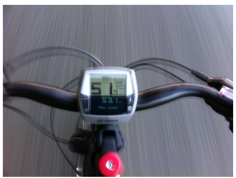
E-bike commute.

We support all initiatives which increase walking, active transport and an integrated transport network.