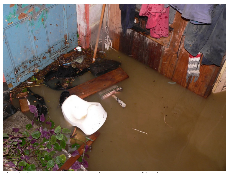
Flooded Waitati House in April 2006.

At Warrington, the waste water settling and treatment pond is located on the Warrington Spit, which is a dynamic coastal environment.