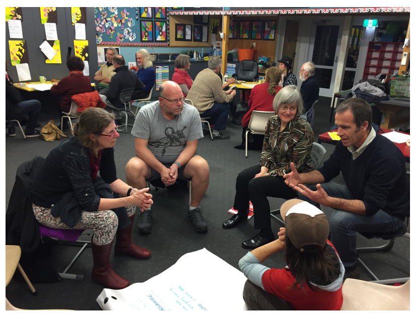
BRCT's 'Building Community Resilience' workshop, 2017.

We congratulate the council for taking a significant step towards genuine investment in place-based groups city wide. This investment signifies a responsive Council — a Council willing to listen to community voices and which understands the importance of community-led development to social wellbeing and economic development.